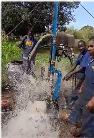
FPCP helped to provide a well in Africa

The Bible tells us that God created everything and it was "good." Yet even before sin entered creation, there was one thing that was "not good." It was not good for the man to be alone, and so God created woman. God designed man and woman for each other. In the same way, God gave us the church to be a community where all are welcome; where we pray and worship together; where we grow in faith and in love for God and each other; where we care for one another; where everyone's gifts are celebrated; where everyone's creativity is unleashed; and where everyone's spiritual growth is mutually upheld. We grieve when popular culture and even parts of the institutional church elevate human feelings above God's design.