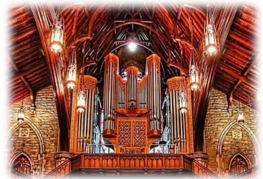
Our amazing pipe organ

The church continues a significant percentage of its budget on mission and services to the disadvantaged. The 24 international flags in the sanctuary represent the countries where First Church supports mission workers.