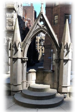
Our unique outdoor pulpit

Also, please take note of the unique outdoor pulpit, symbolizing the Word of God going out to a city and a world which still needs to hear it.